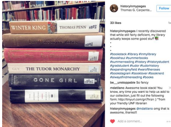
Figure 3: A student compliments the library on Instagram for its selection of reading materials

By listening, library staff has immediate access to patron concerns and compliments.