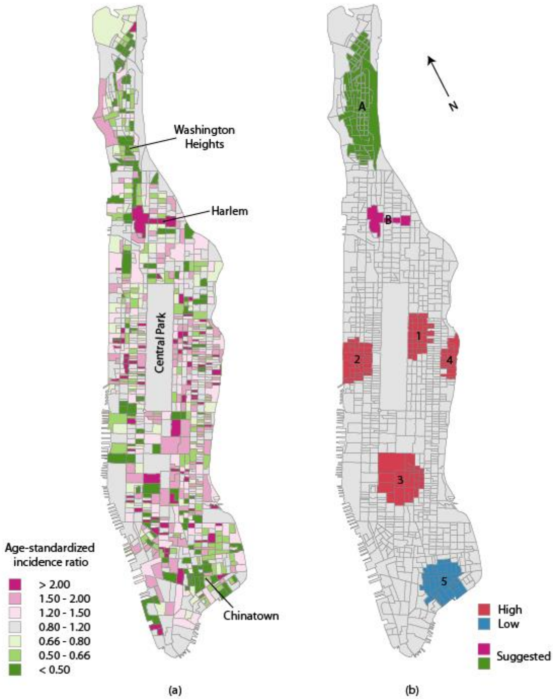
Figure 2. Breast cancer incidence, Manhattan, 2005-2009. (a) Standardized incidence ratios, by block group (b) Clusters as defined by the spatial scan statistic (red and blue) and other areas of interest suggested by the SIR map (magenta and green).