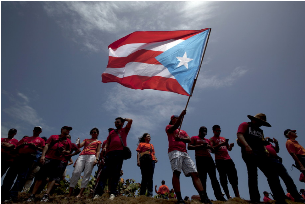
A protest in San Juan against government cuts.