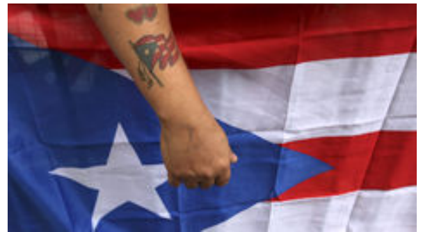
A Puerto Rican tattoo and flag.

Colonialism thus seemed to work. At least it proved to be lucrative for US corporations and investors and of value to the military.